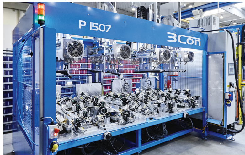
Top image: The 3DEXPERIENCE platform offers a flexible and open environment enabling 3CON to collaborate and exchange information with all stakeholders.